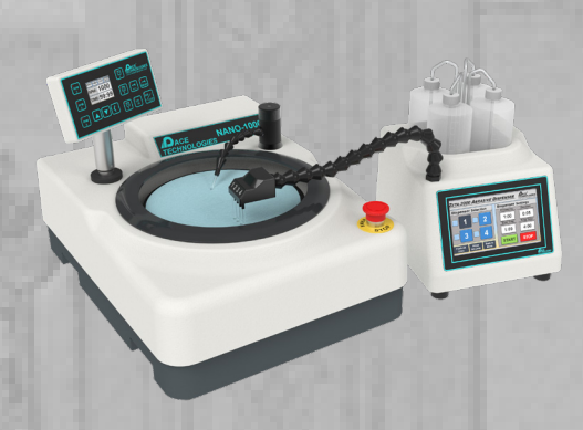
ZETA 2000 Dispenser (optional)