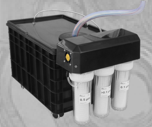
RC-1000 Recirculating / Filter (optional)